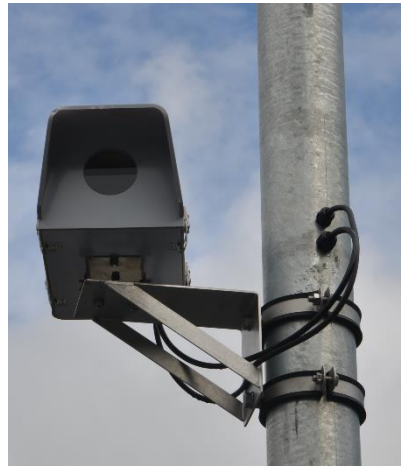
Pole mounting console