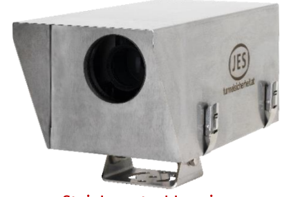
Stainless steel housing