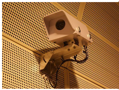
Adjustable wall mounting console