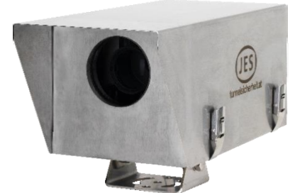
Stainless steel housing