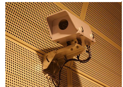
Adjustable wall mounting console