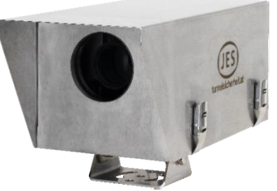
Stainless steel housing