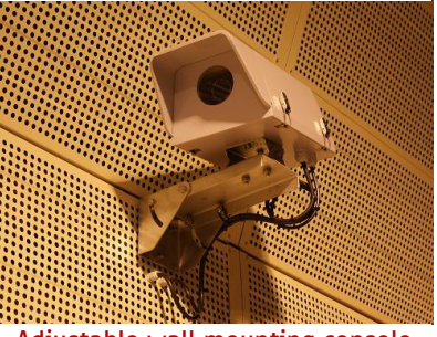
Adjustable wall mounting console