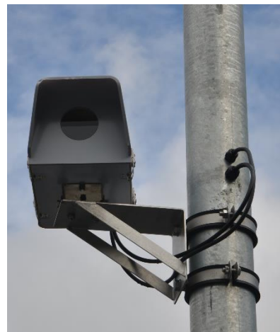
Pole mounting console